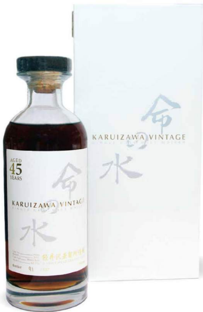
KARUIZAWA WHITE AQUA OF LIFE 45 YEAR 軽井沢 白命之水 45年