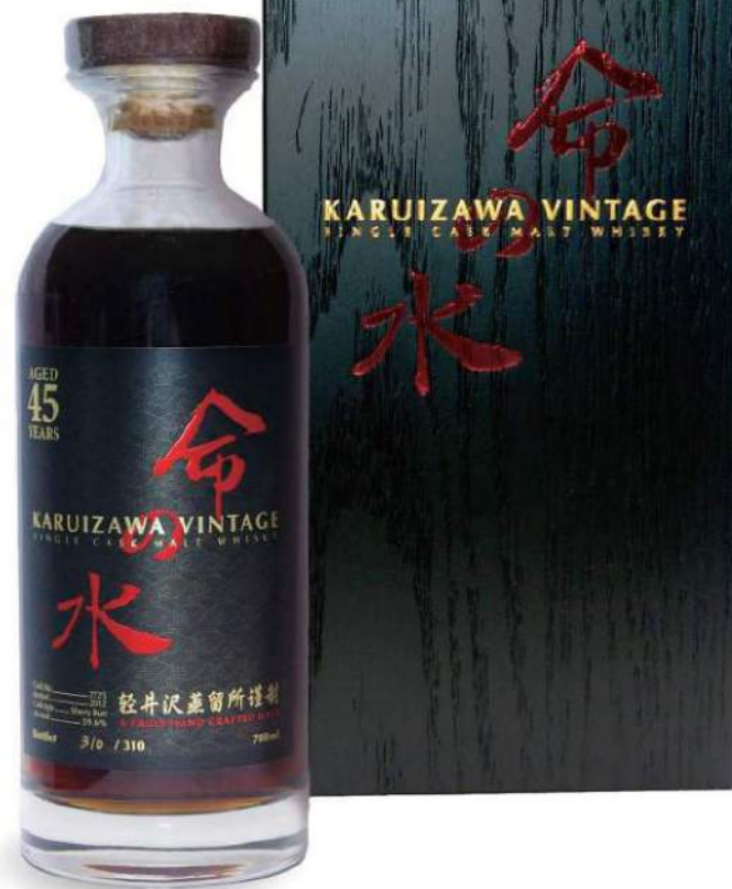
KARUIZAWA BLACK AQUA OF LIFE 45 YEAR 軽井沢 黒命之水 45年