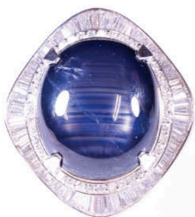
J43 STAR SAPPHIRE DIAMOND RING Pt 900 and diamonds 30.24g, 39.01 ct 藍寶石配鑽石戒指 Estimate: HKD31,000 - 43,400