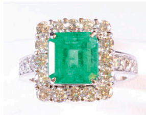
J21 EMERALD & DIAMOND RING Pt 900, emerald and diamonds 11.70g, emerald 3.29ct, diamonds 1.447ct 祖母綠配鑽石戒指 Estimate: HKD29,600 - 41,440