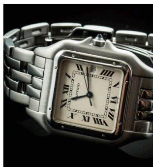
W2 CARTIER PANTHERE Stainless Steel-Men(Jumbo) Case no. CC69359, Quartz Made in Swiss 卡地亞, Panthere, 精鋼, 男裝石英腕錶 Estimate: HKD11,600 - 16,200