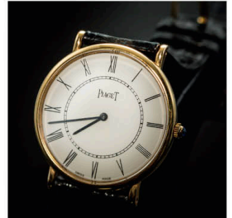
W15 PIAGET 18K Gold-Men Case no. 287206 , Manual Winding Made in Swiss 伯爵, 18K 黃金, 男裝手動上鏈腕錶 Estimate: HKD18,900 - 26,500