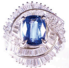
J42 SAPPHIRE DIAMOND RING Pt 900 and diamonds 15g, sapphire 3.82ct, diamond 2.27ct 藍寶石配鑽石戒指 Estimate: HKD23,000 - 32,200