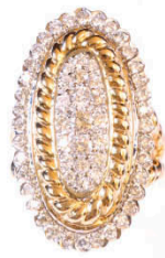
J2 DIAMOND RING K14 gold and diamond 19.6g, diamond approx. 2.00ct 鑽石戒指 Estimate: HKD11,500 - 16,100