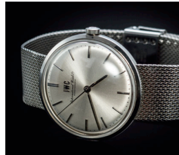
W26 IWC Stainless Steel-Men Case no. 2175506 , Manual Winding Antique Made in Swiss IWC, 精鋼, 古董, 男裝手動上鏈腕錶 Estimate: HKD12,600 - 17,600