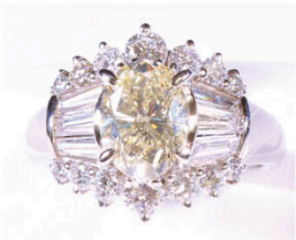
J5 DIAMOND RING Pt 900 and diamonds (with certificate) 8.1g, centre diamond 1.733ct, side diamond 1.34ct 鑽石戒指附證書 Estimate: HKD24,000 - 33,600