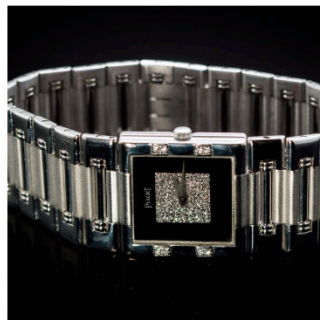
W29 PIAGET DANCER, MODEL 80327K81 18K Gold-Men Case no. 544726 , Quartz Paved & Onyx Dial Made in Swiss 伯爵, Dancer, 型號80327K81, 18K金, 滿天星及鑲瑪瑙錶面, 男裝石英腕錶 Estimate: HKD63,000 - 88,200