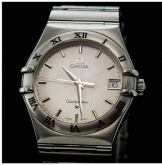
W5 OMEGA CONSTELLATION Stainless Steel-Men Case no. 57423876 , Quartz Made in Swiss 奧米加, 星座系列, 精鋼, 男裝石英腕錶 Estimate: HKD10,500 - 14,700