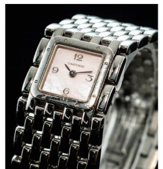
W4 CARTIER PANTHERE RUBAN Stainless Steel-Ladies Case no. 65567PB, Quartz Mother of Pearl Dial Made in Swiss 卡地亞, Panthere Ruban, 珍珠母貝錶盤, 精鋼, 女裝石英腕錶 Estimate: HKD10,500 - 14,700