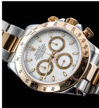
W50 ROLEX 116523 18K Gold & Steel-Men Case no. Y802627 , Automatic Made in Swiss 勞力士, 型號116523, 18K黃金, 精鋼, 男裝自動腕錶 Estimate: HKD73,500 - 102,900