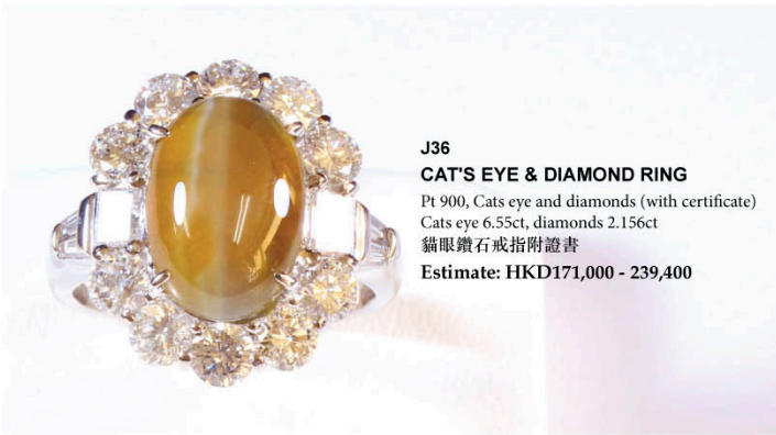
J36 CAT'S EYE & DIAMOND RING Pt 900, Cats eye and diamonds (with certificate) Cats eye 6.55ct, diamonds 2.156ct 貓眼鑽石戒指附證書 Estimate: HKD171,000 - 239,400