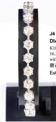
J4 DIAMOND BRACELET K18 and diamonds 16.38g, Diamond ave 0.5ct with total 12.853ct 鑽石手鍊 Estimate: HKD78,000 - 109,200