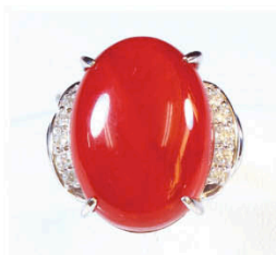
J3 CORAL & DIAMOND RING Pt 900, coral, diamonds (with certificate) 16.24g, coral 40.66ct, diamonds 0.332ct 珊瑚配鑽石戒指附證書 Estimate: HKD27,000 - 37,800