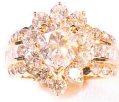
J7 DIAMOND RING K18 and diamonds 16g, centre diamond 2.196ct H SI2 Pear shape, side diamond 2.58ct 鑽石戒指 Estimate: HKD66,000 - 92,400