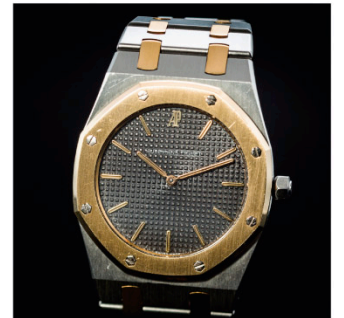
W27 AUDEMARS PIGUET - ROYAL OAK 18K Gold & Steel-Men Case no. 850 , Quartz Made in Swiss 愛彼, Royal Oak, 18K黃金, 精鋼, 男裝石英腕錶 Estimate: HKD25,200 - 35,300