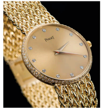
W48 PIAGET, MODEL 8027P50M 18K Gold w/Diamond Case Men Case no. 474273 , Quartz Diamond Dial Made in Swiss 伯爵, 型號 8027P50M, 18K 黃金, 鑲鑽石, 鑽石錶面, 男裝石英腕錶 Estimate: HKD63,000 - 88,200