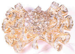
J9 DIAMOND BROOCH K18 and diamonds 31.4g, diamond approx. 3.5ct 鑽石胸針 Estimate: HKD19,500 - 27,300