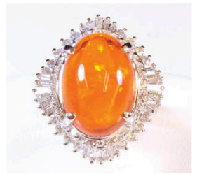
J38 OPAL & DIAMOND RING Pt 900, Mexican opal, diamonds 17.10g, Mexican opal 8.25ct, diamonds 1.47ct 歐帕配鑽石戒指 Estimate: HKD35,000 - 49,000