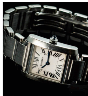
W3 CARTIER TANK FRANCAISE Stainless Steel-Ladies Case no. 780174CD, Quartz Made in Swiss 卡地亞, Tank Francaise 精鋼, 女裝石英腕錶 Estimate: HKD14,700 - 20,600