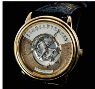
W43 AUDEMARS PIGUET 18K Gold-Men Case no. Star Wheel D7955 , Automatic Transparent Back Made in Swiss 愛彼, 18K黃金, 透明錶底, 男裝自動腕錶 Estimate: HKD115,500 - 161,700