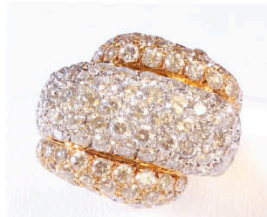
J14 DIAMOND RING K18 and diamonds 14.60g and diamond 5.35ct 鑽石戒指 Estimate: HKD23,500 - 32,900