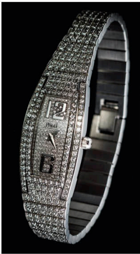
W38 PIAGET, MODEL 54035 18K Gold-Ladies Case no. 863016 , Quartz Paved Watch Certificate Made in Swiss 伯爵, 型號54035, 18K金, 鑲鑽石, 證書, 女裝石英腕錶 Estimate: HKD472,500 - 661,500