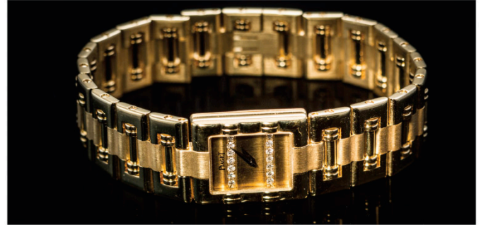
W24 PIAGET MINI DANCER, MODEL 15217K81 18K Gold-Ladies Case no. 535634 , Quartz, Diamond Dial Made in Swiss 伯爵, Mini Dancer 型號15217K81, 18K黃金, 鑽石錶面, 女裝石英腕錶 Estimate: HKD33,600 - 47,000