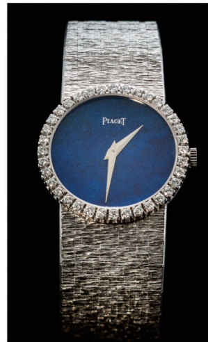
W21 PIAGET, MODEL 9706A6 18K Gold W/Diamond Bezel- Ladies Case no. 164193 , Manual Winding Lapis Dial Made in Swiss 伯爵, 型號9706A6, 18K金, 鑽石錶圈, 青金石錶面, 女裝手動上鏈腕錶 Estimate: HKD39,900 - 55,900