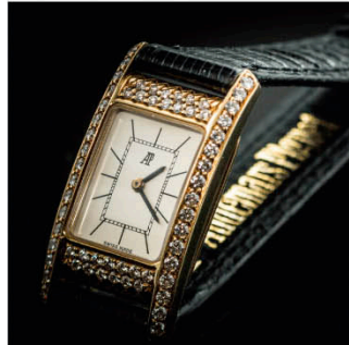
W13 AUDEMARS PIGUET 18K Gold w/ Diamond Case- Ladies Case no. C50125 , Quartz Made in Swiss 愛彼, 18K 黃金鑲鑽石, 女裝石英腕錶 Estimate: HKD28,400 - 39,800