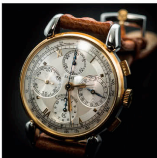
W16 CHRONOSWISS CH7442 Stainless Steel-Men Case no. C741 , Automatic Certificate Made in Swiss 瑞寶, 型號CH7442, 精鋼, 證書, 男裝自動腕錶 Estimate: HKD26,300 - 36,800