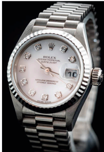
W51 ROLEX 79179NG 18K Gold-Ladies Case no. A308997 , Automatic Mother of Pearl + Diamond Dial Made in Swiss 勞力士, 型號79179NG, 18K金, 珍珠母貝錶面, 鑽石錶面, 女裝自動腕錶 Estimate: HKD94,500 - 132,300