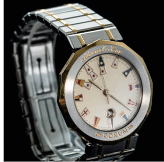
W9 CORUM ADMIRAL'S CUP, MODEL 99.810.21 V-52 18K Gold & Steel-Men Case no. 476742 , Quartz Made in Swiss 崑崙, 海軍上將盃系列, 型號99.810.21 V-52, 18K 黃金, 精鋼, 男裝石英腕錶 Estimate: HKD8,400 - 11,800