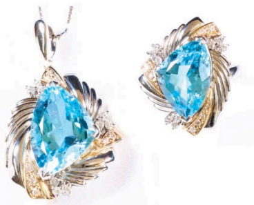
J44 TOPAZ RING & PENDANT SET PT/K18 and topaz and diamonds 37.25g, pendant topaz 10.34ct, diamond 0.27ct, ring topaz 10.37ct, diamond 0.26ct, PT/K18 托帕石配鑽石戒指及垂飾 Estimate: HKD19,500 - 27,300