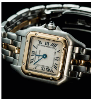
W1 CARTIER PANTHERE, MODEL 1057917 18K Gold & Steel-Ladies Case no. 018907, Quartz Made in Swiss 卡地亞, Panthere 型號1057917, 18K 黃金, 精鋼, 女裝石英腕錶 Estimate: HKD9,500 - 13,300