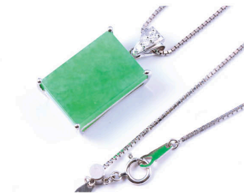
J31 JADEITE NECKLACE K18, jadeite (with certificate) K18 white 6.99g + 4.11g for chain, jadeite type A 14.11ct 翡翠頸鍊附證書 Estimate: HKD43,000 - 60,000