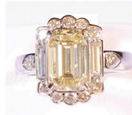
J11 DIAMOND RING Pt 900 and diamonds 8.78g, centre diamond 3.02ct light yellow SI1 emerald cut, side diamond 1.15ct 鑽石戒指 Estimate: HKD85,000 - 119,000