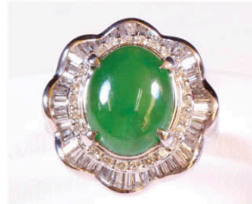
J29 JADEITE & DIAMOND RING Pt 900, jadeite and diamonds (with certificate) 14.80g, jadeite 4.18ct, diamonds 0.90ct 翡翠配鑽石戒指附證書 Estimate: HKD19,000 - 26,600