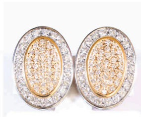
J37 MENS DIAMOND CUFFS Pt 900, K18 and diamonds 14.35g and diamond 0.94+0.89ct 鑽石袖口鈕扣 Estimate: HKD11,500 - 16,100