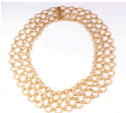
J33 K18 NECKLACE K18 128.1g 18K頸鍊 Estimate: HKD43,000 - 60,200