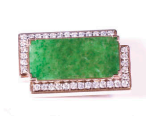
J25 JADEITE & DIAMOND PENDANT K18 and diamonds diamond and jade pendant diamond - 1.03ct K18/K14 12.6g 翡翠配鑽石垂飾 Estimate: HKD11,500 - 16,100