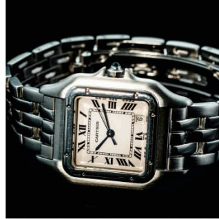
W10 CARTIER PANTHERE Stainless Steel-Men Case no. 201483CD , Quartz Made in Swiss 卡地亞, Panthere, 精鋼, 男裝石英腕錶 Estimate: HKD10,000 - 14,000