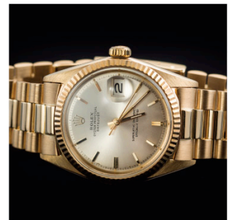
W31 ROLEX 1601-8 18K Gold-Men Case no. 1060859 , Automatic Antique Made in Swiss 勞力士, 型號1601-8, 18K黃金, 古董, 男裝自動腕錶 Estimate: HKD47,300 - 66,200