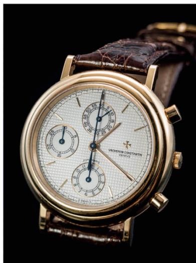
W53 VACHERON CONSTANTIN 18K Gold-Men Case no. 606161 , Automatic Chronograph Certificate Made in Swiss 江詩丹頓, 18K黃金, 證書, 男裝自動腕錶 Estimate: HKD94,500 - 132,300