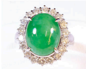
J27 JADEITE & DIAMOND RING Pt 900, jadeite and diamonds (with certificate) 13.18g, jadeite 8.08ct, diamonds 1.18ct 翡翠配鑽石戒指附證書 Estimate: HKD17,000 - 23,800