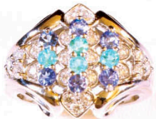
J1 DIAMOND RING Pt 900, Paraiba, Tanzanite and diamond 990g, Paraiba 0.26ct, tanzanite 0.45ct, diamond 0.34ct 鑽石戒指 Estimate: HKD8,200 - 11,480