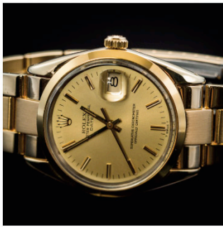
W19 ROLEX 15505 18K Gold Filled S / Steel-Men Case no. 7283127 , Automatic Made in Swiss 勞力士, 型號15505, 18K 黃金活, 精鋼, 男裝自動腕錶 Estimate: HKD23,100 - 32,300