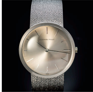
W23 AUDEMARS PIGUET 18K Gold-Men Case no. B35715 , Manual Winding Made in Swiss 愛彼, 18K金, 男裝手動上鏈腕錶 Estimate: HKD28,400 - 39,800