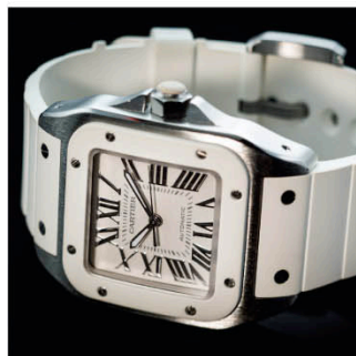
W17 CARTIER SANTOS 100 Stainless Steel-Ladies Case no. 203927LX , Automatic Made in Swiss 卡地亞, Santos 100 系列, 精鋼, 女裝自動腕錶 Estimate: HKD26,300 - 36,800