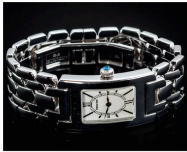
W33 AUDEMARS PIGUET 18K Gold-Ladies Case no. Promesse E30340 , Quartz Made in Swiss 愛彼, 18K金, 女裝石英腕錶 Estimate: HKD68,300 - 95,600