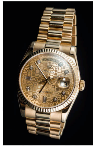
W34 ROLEX 118238J 18K Gold-Men Case no. K142080 , Automatic Diamond Dial Made in Swiss 勞力士, 型號118238J, 18K黃金, 鑽石錶面, 男裝自動腕錶 Estimate: HKD152,300 - 213,200