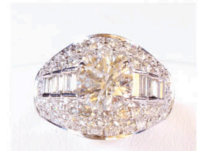
J16 DIAMOND RING Pt 900 and diamonds Pt 900 14g, centre diamond 2.232ct, side diamonds 2.40ct 鑽石戒指 Estimate: HKD46,000 - 64,400