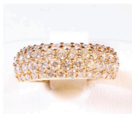
J18 DIAMOND RING K18 and diamonds K18 7.3g, diamonds 1.50ct 鑽石戒指 Estimate: HKD7,000 - 9,800