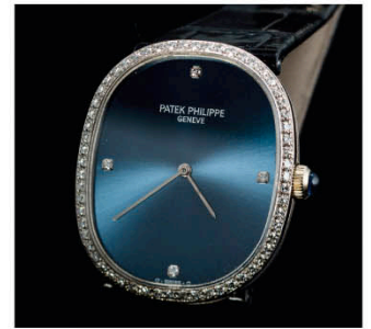
W40 PATEK PHILIPPE 3849 18K Gold w/Diamond Case Men Case no. 2903718 , Manual Winding Diamond Dial Made in Swiss 百達翡麗, 型號3849, 18K金, 鑲鑽石, 鑽石錶面, 男裝手動上鏈腕錶 Estimate: HKD94,500 - 132,300