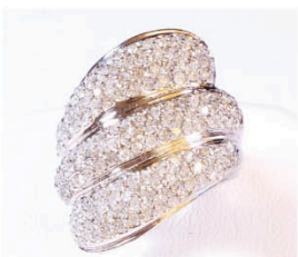
J17 DIAMOND RING Pt 900 and diamonds Pt 900 10.6g, diamonds 2.00ct 鑽石戒指 Estimate: HKD5,500 - 7,700