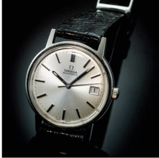
W8 OMEGA Stainless Steel-Men Automatic Made in Swiss 奧米加, 精鋼, 男裝自動腕錶 Estimate: HKD7,400 - 10,400