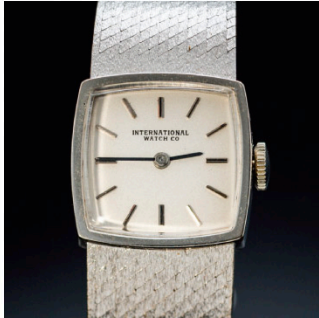
W22 IWC 18K Gold-Ladies Case no. 2035468 , Manual Winding Antique Made in Swiss IWC, 18K金, 古董, 女裝手動上鏈腕錶 Estimate: HKD21,000 - 29,400