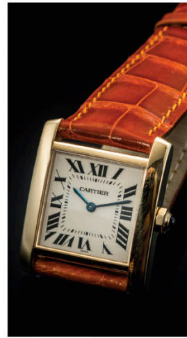
W7 CARTIER TANK FRANCAISE 18K Gold-Mid Size Case no. 118392CD , Quartz Made in Swiss 卡地亞, Tank Francaise, 18K黃金石英腕錶 Estimate: HKD33,600 - 47,000