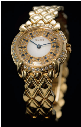
W25 CHAUMET 18K Gold w/Diamond Case- Ladies Case no. 208643 , Quartz Diamond+Sapphire+Mother of Pearl Dial Made in Swiss 尚美, 18K 黃金鑲鑽石, 藍寶石, 珍珠母貝錶盤, 女裝石英腕錶 Estimate: HKD68,300 - 95,600