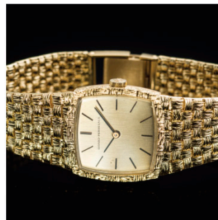
W30 GIRARD PERREGAUX 18K Gold-Ladies Case no. 639HA , Manual Winding Antique Made in Swiss 芝柏錶, 18K黃金, 古董, 女裝手動上鏈腕錶 Estimate: HKD21,000 - 29,400