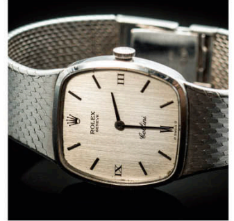
W11 ROLEX CELLINI 18K Gold-Ladies Case no. 3683529 , Manual Winding Made in Swiss 勞力士, Cellini, 18K 金, 女裝手動上鏈腕錶 Estimate: HKD20,000 - 28,000