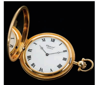
W44 CHOPARD, MODEL 3014 18K Gold Case no. 210523 , Manual Winding Pocket Watch Made in Swiss 蕭邦, 型號3014, 18K黃金, 手動上鏈懷錶 Estimate: HKD31,500 - 44,100