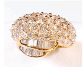
J12 DIAMOND RING K18 gold and diamonds 8.78g, diamond 3.1ct 鑽石戒指 Estimate: HKD18,000 - 25,200