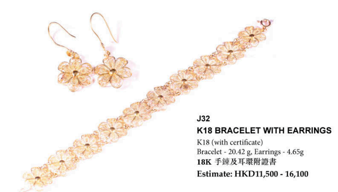
J32 K18 BRACELET WITH EARRINGS K18 (with certificate) Bracelet - 20.42 g, Earrings - 4.65g 18K 手鍊及耳環附證書 Estimate: HKD11,500 - 16,100