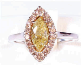
J13 DIAMOND RING Pt 900, K18 and diamonds 4.74g, centre diamond 1.105ct fancy yellow, side pink diamond 0.321ct 鑽石戒指 Estimate: HKD23,500 - 32,900