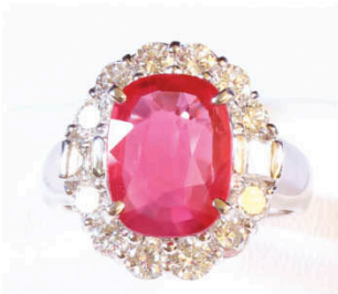
J39 RUBY & DIAMOND RING Pt 900, ruby and diamonds 8.0g, ruby 3.236ct, diamonds 1.33ct 紅寶石配鑽石戒指 Estimate: HKD43,000 - 60,200