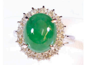
J30 JADEITE & DIAMOND RING Pt 900, jadeite and diamonds (with certificate) 12.05g, jadeite 6.326ct, diamonds 1.09ct 翡翠配鑽石戒指附證書 Estimate: HKD39,000 - 54,600