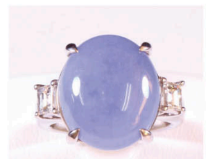
J35 LAVENDER JADEITE & DIAMOND RING Pt 900, jadeite and diamonds (with certificate) 13.3g, jadeite 10.33ct, diamonds 0.50ct 天然紫翡翠配鑽石戒指附證書 Estimate: HKD23,000 - 32,200