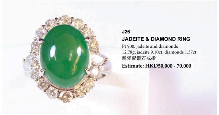
J26 JADEITE & DIAMOND RING Pt 900, jadeite and diamonds 12.78g, jadeite 9.10ct, diamonds 1.37ct 翡翠配鑽石戒指 Estimate: HKD50,000 - 70,000