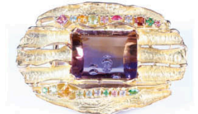
J8 AMETHYST BROOCH K18 and amethyst Brooch 34.4g, amethyst 32.29ct 紫水晶胸針 Estimate: HKD11,500 - 16,100