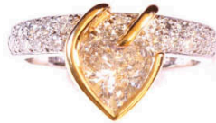
J6 DIAMOND RING Pt 900, K18 and diamonds 8.94g, centre diamond 1.106ct, side stone 0.28ct 鑽石戒指 Estimate: HKD14,800 - 20,720