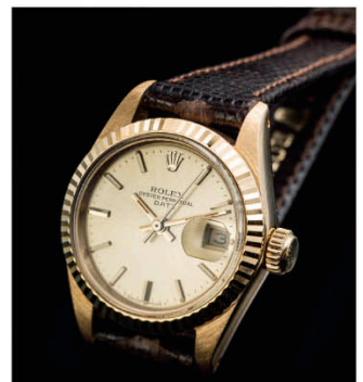
W54 ROLEX 6917-8 18K Gold-Ladies Case no. 7206871 , Automatic Antique Made in Swiss 勞力士, 型號6917-8, 18K黃金, 古董, 女裝自動腕錶 Estimate: HKD21,000 - 29,400