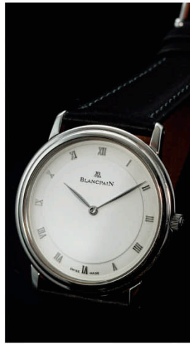
W6 BLANCPAIN Stainless Steel-Men Case no. 332 , Manual Winding Made in Swiss 寶珀, 精鋼, 男裝手動上鏈腕錶 Estimate: HKD20,000 - 28,000