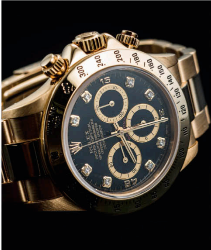
W35 ROLEX 16528G 18K Gold-Men Case no. X661592 , Automatic Diamond Dial Made in Swiss 勞力士, 型號16528G, 18K黃金, 鑽石錶面, 男裝自動腕錶 Estimate: HKD152,300 - 213,200