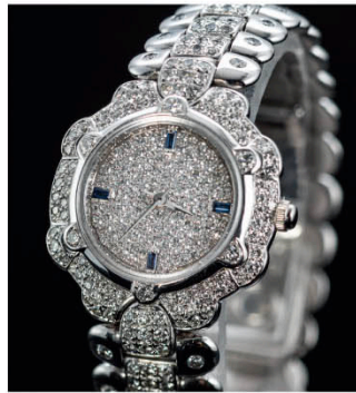
W47 DELANEAU 18K Gold w/Diamond Case-Ladies Case no. 26368 , Quartz Paved Dial Made in Swiss 帝後, 18K金, 鑲鑽石, 滿天星錶面, 男裝石英腕錶 Estimate: HKD63,000 - 88,200