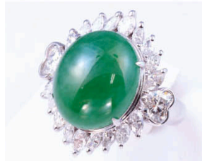
J28 JADEITE & DIAMOND RING Pt 900, jadeite, and diamond (with certificate) 17.59g, jadeite 12.232 ct, diamond 2.43ct 翡翠配鑽石戒指附證書 Estimate: HKD117,000 - 160,000