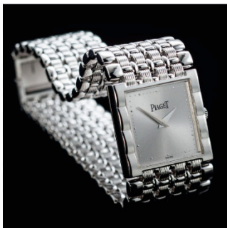
W28 PIAGET, MODEL 80131K75 18K Gold-Men Case no. 658059 , Quartz Certificate Made in Swiss 伯爵, 型號80131K75, 18K金, 證書, 男裝石英腕錶 Estimate: HKD55,700 - 78,000