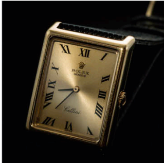
W12 ROLEX CELLINI 18K Gold-Men Case no. 4265519 , Manual Winding Made in Swiss 勞力士, Cellini, 18K 黃金, 男裝手動上鏈腕錶 Estimate: HKD20,000 - 28,000