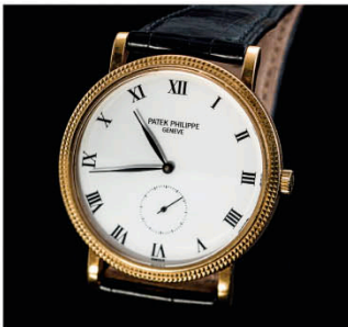
W41 PATEK PHILIPPE 3919J 18K Gold-Men Case no. 2916989 , Manual Winding Made in Swiss 百達翡麗, 型號3919J, 18K黃金, 男裝手動上鏈腕錶 Estimate: HKD84,000 - 117,600