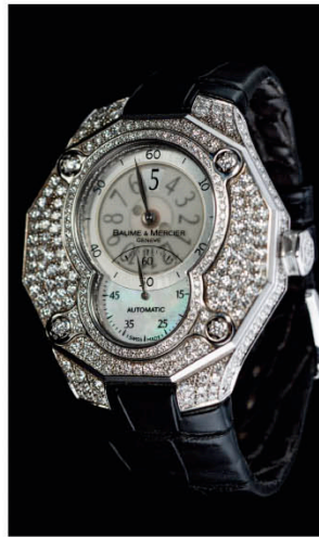
W39 BAUME & MERCIER 18K Gold w/Diamond Case Men Case no. 5310692 , Automatic Transparent Back Made in Swiss 名士, 18K金, 鑲鑽石, 透明錶底, 男裝自動腕錶 Estimate: HKD210,000 - 294,000