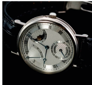
W42 BREQUET 3130 18K Gold-Men Case no. 4473 , Automatic Certificate + Box Made in Swiss 寶璣, 型號3130, 18K金, 證書及錶盒, 男裝自動腕錶 Estimate: HKD147,000 - 205,800