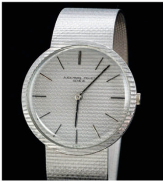
W45 AUDEMARS PIQUET 18K Gold-Men Case no. 72097 , Manual Winding Made in Swiss 愛彼, 18K金, 男裝手動上鏈腕錶 Estimate: HKD31,500 - 44,100