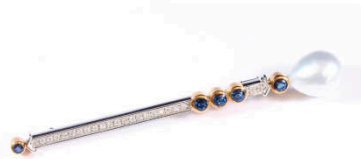
J10 PEARL BROOCH Pt 900, K18, pearl, sapphire and diamonds 12.23g, sapphire 1.28ct, diamond 0.22ct 珍珠胸針 Estimate: HKD8,600 - 12,040