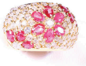
J40 RUBY AND DIAMOND RING K18, ruby and diamonds K18 gold, 11.1g, diamond 1.6ct, ruby 1.85ct 紅寶石配鑽石戒指 Estimate: HKD8,600 - 12,040