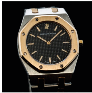
W20 AUDEMARS PIGUET - ROYAL OAK 18K Gold & Steel-Mid Size Case no. 1120 , Quartz Made in Swiss 愛彼, Royal Oak, 18K黃金, 精鋼, 石英腕錶 Estimate: HKD21,000 - 29,400