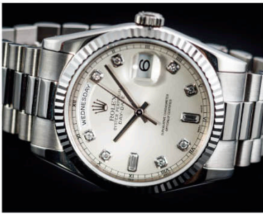
W32 ROLEX 118239A 18K Gold-Men Case no. K894986 , Automatic Diamond Dial Made in Swiss 勞力士, 型號118239A, 18K金, 鑽石錶面, 男裝自動腕錶 Estimate: HKD147,000 - 205,800