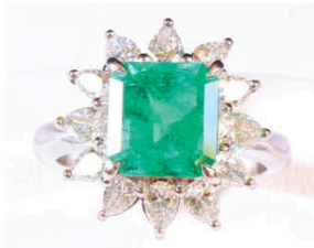
J20 EMERALD & DIAMOND RING Pt 900, emerald and diamonds 10.02g, emerald 2.97ct, diamonds 1.33ct 祖母綠配鑽石戒指 Estimate: HKD23,000 - 32,200