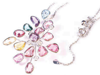
J41 SAPPHIRE DIAMOND NECKLACE K18 white gold, sapphire and diamond (with certificate) 8.82g, sapphire 11.90ct, diamond 0.39ct 藍寶石頸鍊附證書 Estimate: HKD10,100 - 14,140