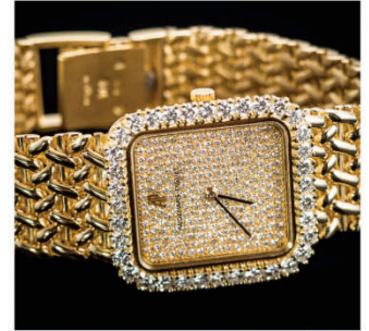
W37 AUDEMARS PIGUET 18K Gold w/Diamond Bezel-Men Case no. C56156 , Manual Winding Paved Dial Made in Swiss 愛彼, 18K黃金, 鑽石錶面, 男裝手動上鏈腕錶 Estimate: HKD115,500 - 161,700