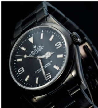
W49 ROLEX 114270 Stainless Steel-Men Case no. F319221 , Automatic PVD Made in Swiss 勞力士, 型號114270, 精鋼, PVD, 男裝自動腕錶 Estimate: HKD36,800 - 51,500