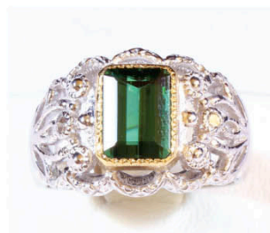
J45 TOURMALINE & DIAMOND RING K18 W/Y, tourmaline and diamonds 8.10g, tourmaline 2.10ct, diamonds - 0.06ct 電氣石配鑽石戒指 Estimate: HKD5,500 - 7,700