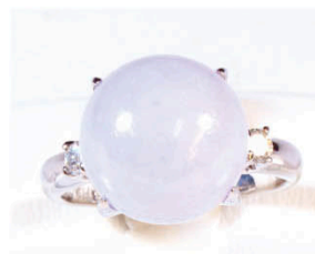
J34 LAVENDER JADEITE & DIAMOND RING Pt 900, jadeite and diamonds (with certificate) 8.71g, jadeite 16.712ct, diamonds 0.148ct 天然紫翡翠配鑽石戒指附證書 Estimate: HKD27,000 - 37,800