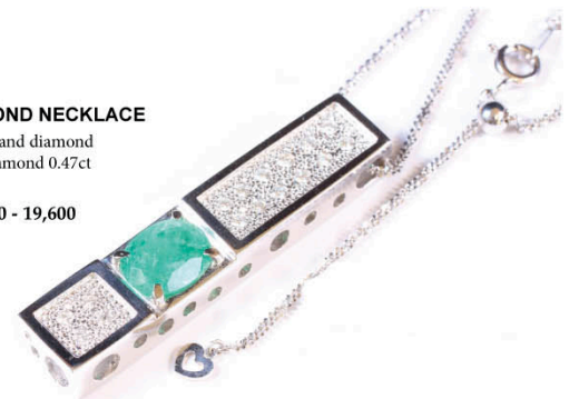
J19 EMERALD & DIAMOND NECKLACE K18 white gold, emerald and diamond 17.4g, emerald 3.19ct, diamond 0.47ct 祖母綠配鑽石頸鍊 Estimate: HKD14,000 - 19,600