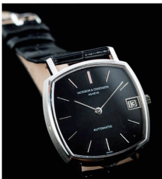
W52 VACHERON CONSTANTIN 18K Gold-Men Case no. 479716 , Automatic Made in Swiss 江詩丹頓, 18K金, 男裝自動腕錶 Estimate: HKD39,900 - 55,900