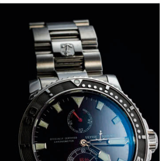
W18 ULYSSE NARDIN MARINE Stainless Steel-Men Case no. 2744 , Automatic Certificate Made in Swiss 雅典, Marine 系列, 精鋼, 證書, 男裝自動腕錶 Estimate: HKD42,000 - 58,800