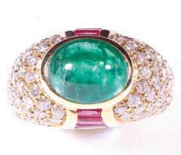
J22 EMERALD RING WITH RUBY AND DIAMONDS K18, ruby and diamonds 16.3g, ruby approx 0.50ct, diamond 2.50ct 祖母綠配鑽石戒指 Estimate: HKD27,000 - 37,800