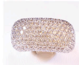
J15 DIAMOND RING K18 and diamonds K18 white gold 18.5g, diamond 5.10ct 鑽石戒指 Estimate: HKD24,000 - 33,600