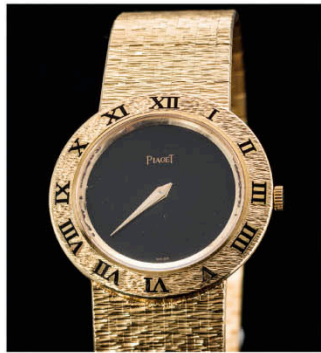
W46 PIAGET 9118A6 18K Gold-Men Case no. 260391 , Manual Winding Made in Swiss 伯爵, 型號 9118A6, 18K黃金, 男裝手動上鏈腕錶 Estimate: HKD33,600 - 47,000