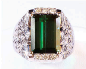
J24 GREEN TOURMALINE DIAMOND RING Pt 900, green tourmaline and diamonds 18.74g, green tourmaline 7.10ct, diamonds 0.75ct 電氣石配鑽石戒指 Estimate: HKD15,500 - 21,700