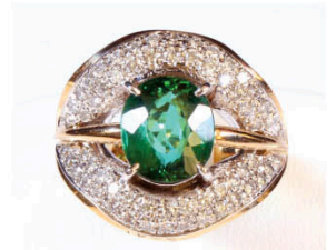
J23 GREEN TOURMALINE DIAMOND RING Pt 900, K18, green tourmaline and diamonds (with certificate) 18.36g, green tourmaline 3.829ct, diamond 0.80ct 電氣石配鑽石戒指附證書 Estimate: HKD17,000 - 23,800