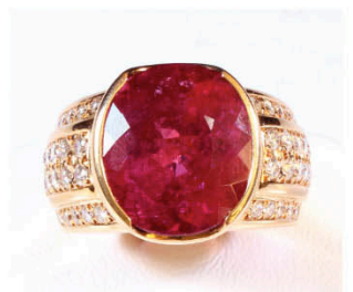
J46 TOURMALINE & DIAMOND RING K18, tourmaline and diamonds (with certificate) 24.6g, pink tourmaline 13.89ct, diamonds 1.01ct 電氣石配鑽石戒指附證書 Estimate: HKD21,000 - 29,400