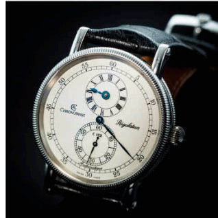
W14 CHRONOSWISS Stainless Steel-Men Case no. 6991 , Automatic Transparent Back Made in Swiss 瑞寶, 精鋼, 透明錶底, 男裝自動腕錶 Estimate: HKD23,100 - 32,300